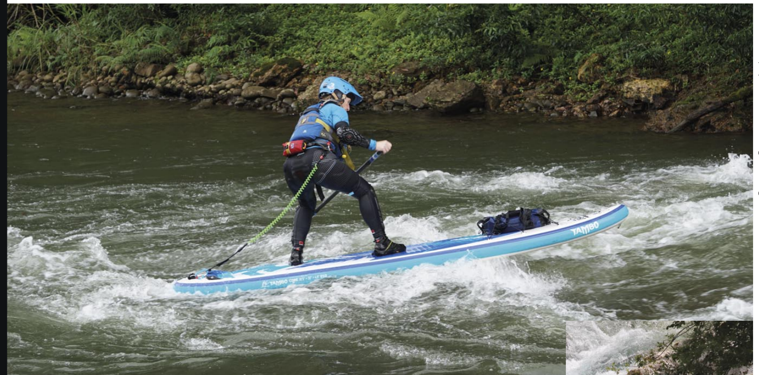
Photo: Sarapiqui, Costa Rica