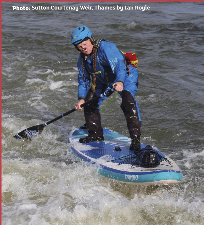
Sutton Courtenay Weir, Thames