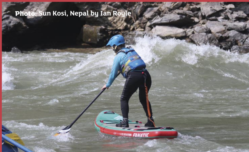
Photo: Sun Kosi, Nepal