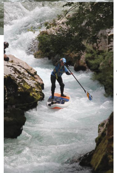
Photo: Soca, Slovenia