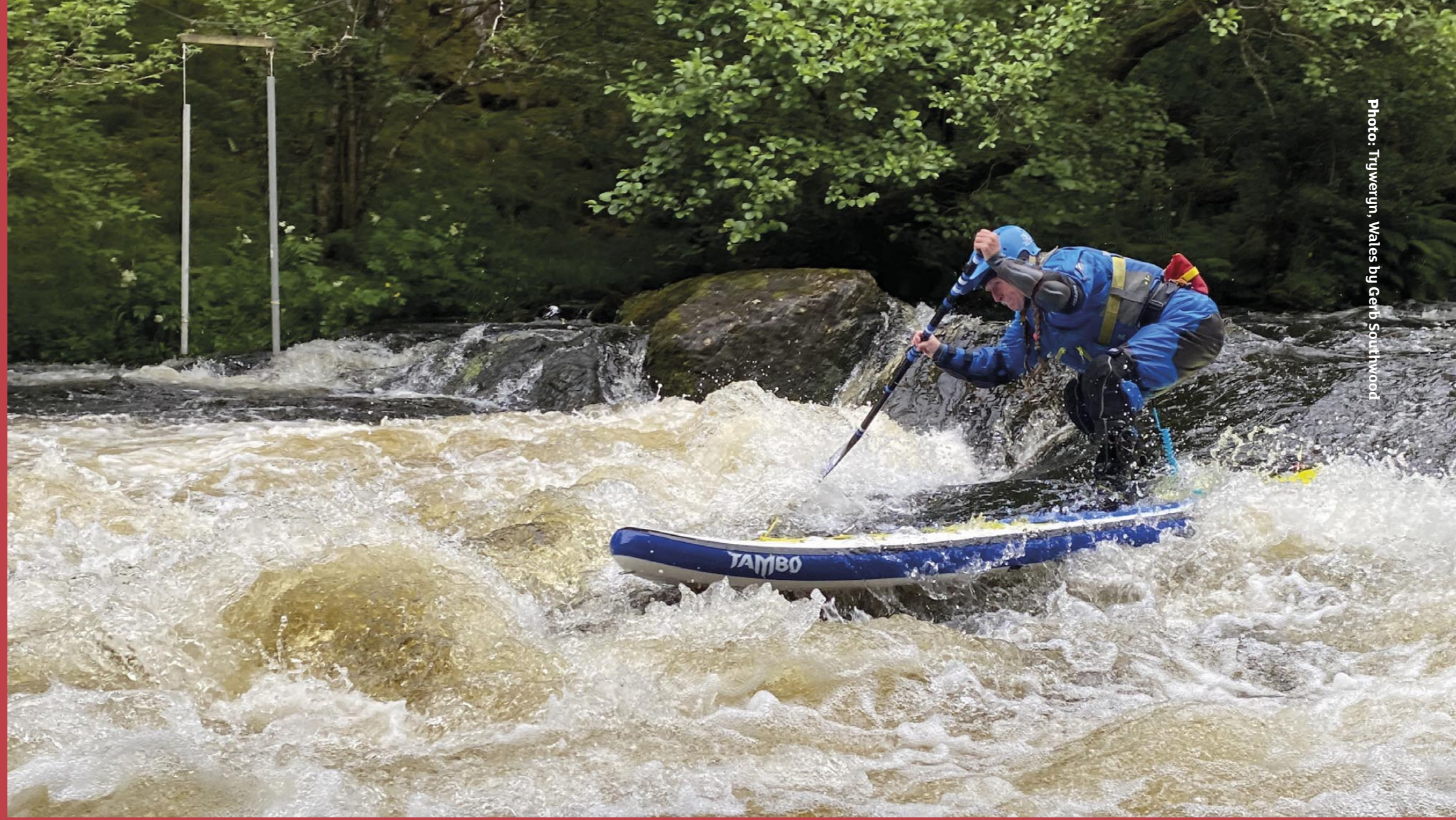
Photo: Tryweryn, Wales